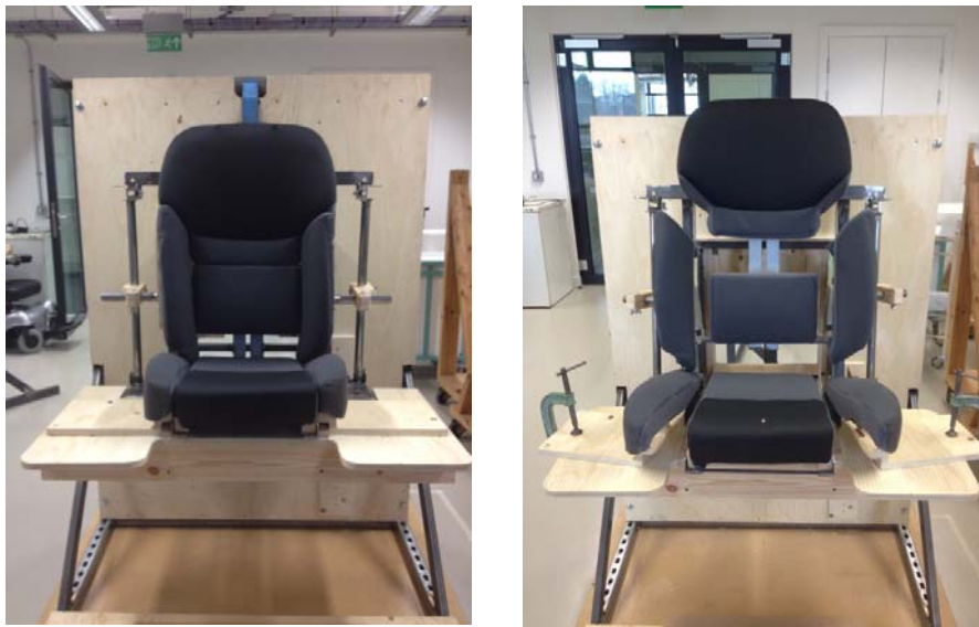
Figure 2. Fitting trial driving rig in proximal and distal set up (left to right).

The seat was developed from a current production Nissan NV200 seat, which was selected as a benchmark seat in the LCV market. Once the nine sub-components were identified: Seat Height; Pedal Distance; Seat Base Length; Seat Base Width; Lumbar Height; Lumbar Prominence; Upper Backrest Height; Backrest Lateral Support; Armrest Position, the seat was cut in to sections and re-upholstered accordingly (Figure 2). The driving rig was set up for automatic transmission with just the accelerator (A) and brake (B) pedals and a fully adjustable steering wheel in terms of height, proximity and angle. The dimensions were measured using an anthropometer.