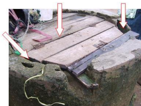
Photograph 1. Fully covered well with gaps within planks, and see-through openings between cover and head wall

Experience with this study however shows that ‘yes or no’ sanitary scoring approach assumes a rigid correspondence between the assessment criteria and the observed sanitary faults. Hand dug wells, which are generally expected to be completed with hand pump, for instance, are not. Well covers exist in varying degree of materials and covering range (Photographs 1 and 2). In the study area, there is also no known regulation for especially self supply well design, source and water safety. Water source construction, user activities and source handling of self supply sources are typically a function of source ownership, investment capabilities and water use priorities. In which case construction quality, design and source handling varies. The extent of variation in any of observed sanitary faults do not therefore usually fit a ‘yes or no’ assessment score method, but arguably captured in the 1 – 5 scoring approach.