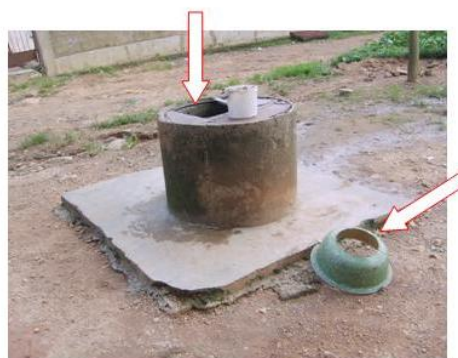
Photograph 2. Partially covered well; the perforated bowl cover used for the covering of the un-covered part is placed next to the well

Examples of self supply dug wells showing varied degree of covering