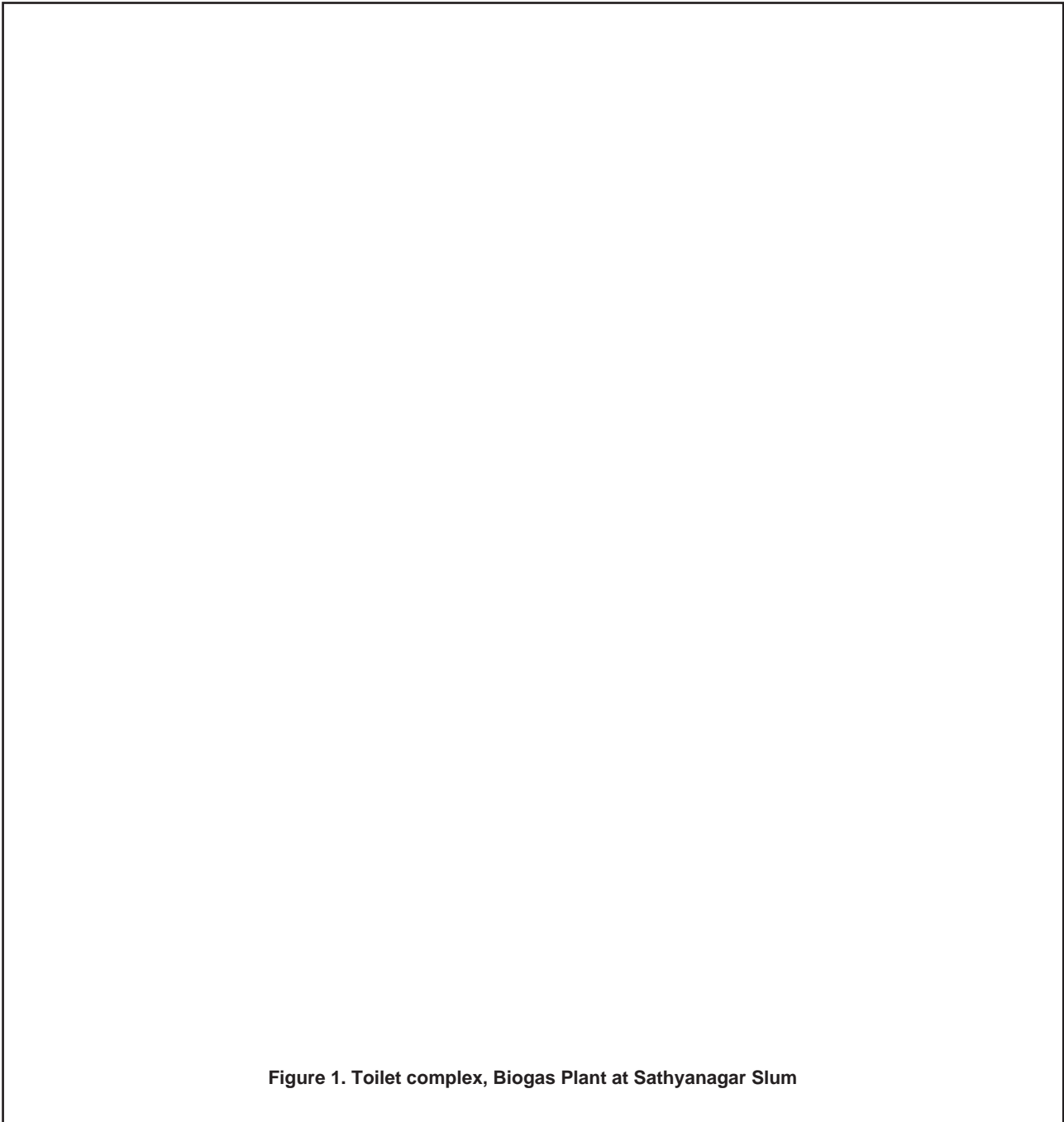
Figure 1. Toilet complex, Biogas Plant at Sathyanagar Slum

night soil as the feed material. Moreover within the city limits, it makes more sense to treat night soil rather than look for cow dung as a method of generating biogas.