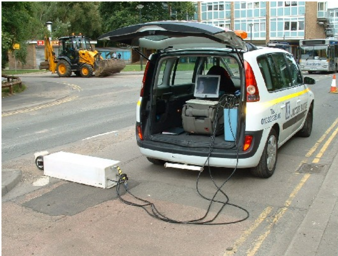
Figure 4. Transverse survey across road. The display screen is visible inside the survey vehicle, with SIR-10H unit to its right (connected to the antennae box by three cables).

processing and filtering stages including corrections to allow for the fact that the GPR antennae are not in direct contact with the road surface, background noise removal and conversion of signal travel times to depths within the pavement structure.