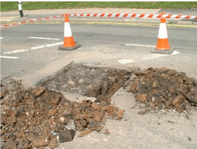
Figure 2. Trial pit showing bituminous road pavement, pitchings and silty clay subgrade

The bituminous road pavement was generally in a poor condition and contained several areas where previous maintenance had been conducted. Ruts and cracks could clearly be observed on both repaired and un-repaired areas, and maintenance work to plane off of the bituminous layer and replace it with new material was being considered. Information on the depth of the various layers in the road, especially to the bottom of the bituminous layer along the length of the site and on the presence and thickness of sub-base, had to be determined before planing could be planned.