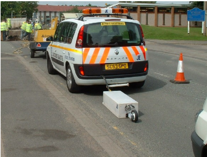
Figure 3. GPR survey vehicle, with antennae housing in towing position

GPR data were referenced to local site chainages, which were marked from fixed features which could be easily found if the site was re-visited (such as centre lines of road junctions). It has been known for site chainages to be referenced to parked vehicles, or have descriptions in site notes such as "lamp-post", which prove extremely unhelpful when later trying to establish site locations. The importance of accurate site chainages can often be overlooked during a site investigation, and for sites where changes and features occur at relatively close spacings and short distances, an accurate chainage system becomes even more significant. The most accurate and carefully collected GPR data can become virtually useless if its location on the site is uncertain or unknown.