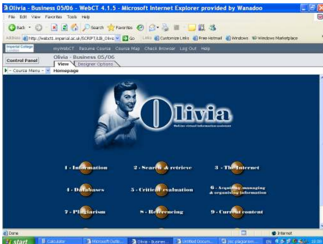
Illustration 1: OLIVIA: Online Information Assistant. WebCT Course. Imperial College London

Once students have a clear understanding of plagiarism the librarians then introduce them to referencing. Citing is explained for books, journal articles, chapters in books, multimedia etc. They are then shown the format for information sources for a reference list. This includes sources such as emails, official papers, interviews etc. At the end of the session they submit a quiz. If any person who takes the quiz receives a low mark (and these are in the minority) the librarian contacts them and arranges a one to one session to discuss areas that the student may be confused about.